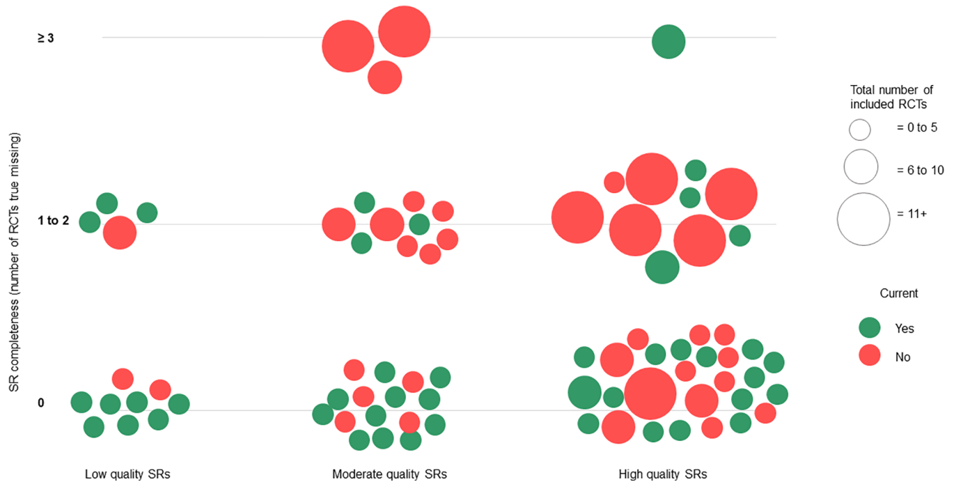
Fig 1. Currency, completeness, and quality of single-intervention systematic reviews. Each bubble represents a single-intervention systematic review (n = 80). The ideal scenario is for bubbles to sit in the bottom right corner (denoting high quality and completeness), and be green in colour (denoting currency). Abbreviations: RCT = randomised controlled trial, SR = systematic review.

https://doi.org/10.1371/journal.pone.0198676.g001